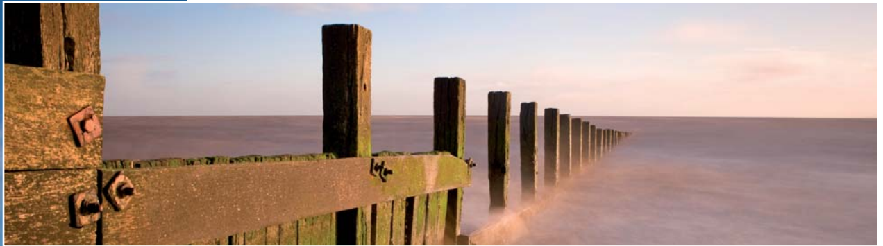
Sunsets & Seascapes