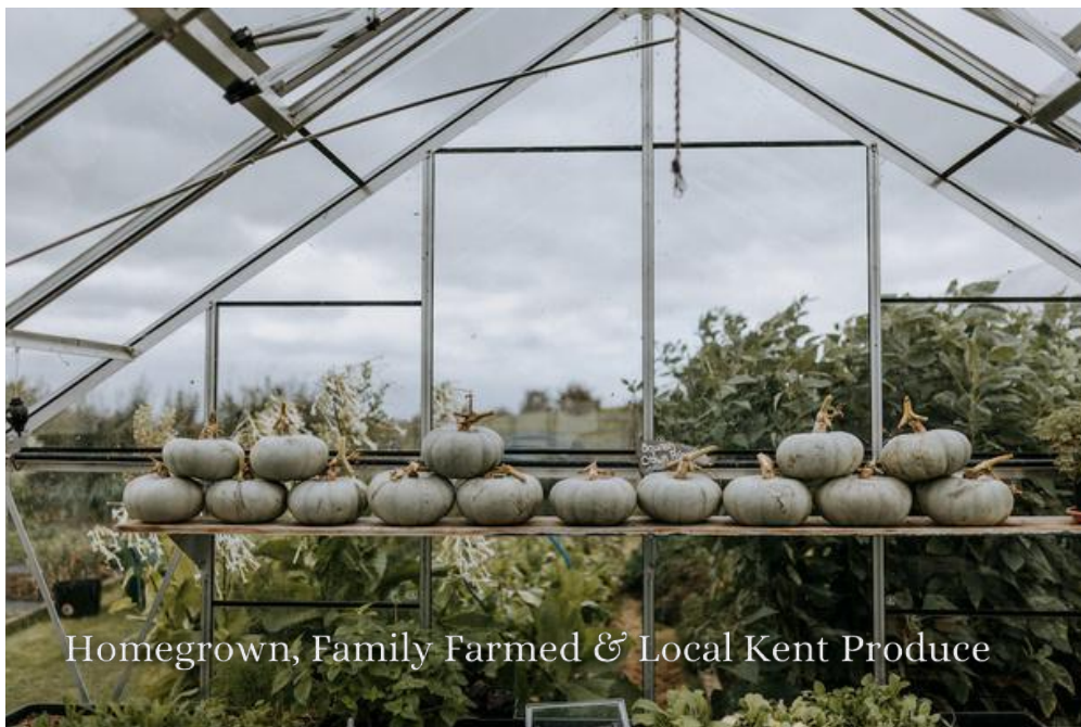
Homegrown, Family Farmed & Local Kent Produce

Our ethos also extends to the bar, where you can try a wealth of Kitchen Garden inspired cocktails and mocktails, Kent beers, wines and soft drinks, not to mention a selection of Copper Rivet spirits made using our family-farm grains.